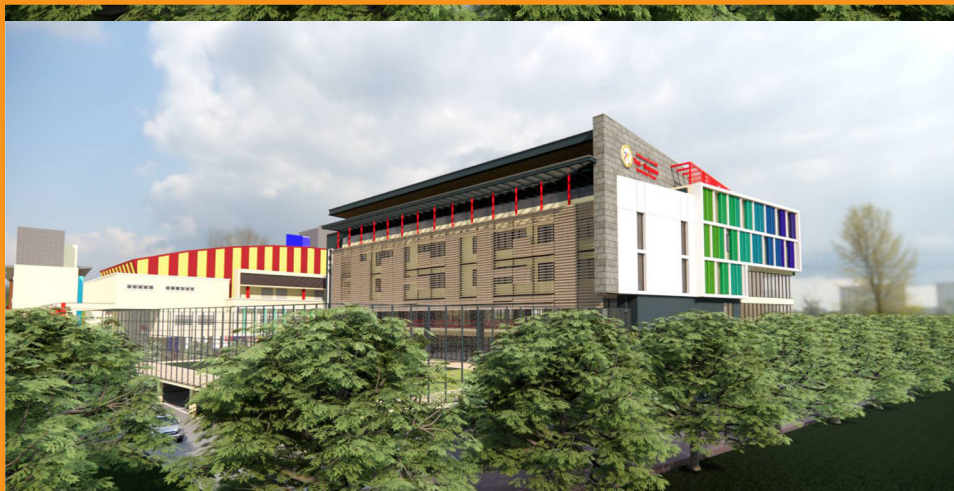
Transforming dreams into reality: anticipate a new landmark by 2025