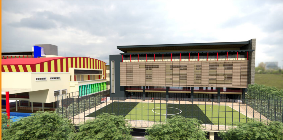
"Building Tomorrow, Today!" Operational by August 2025