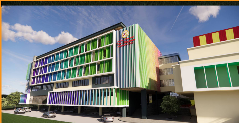
Pardon our progress! Exciting addition coming soon!