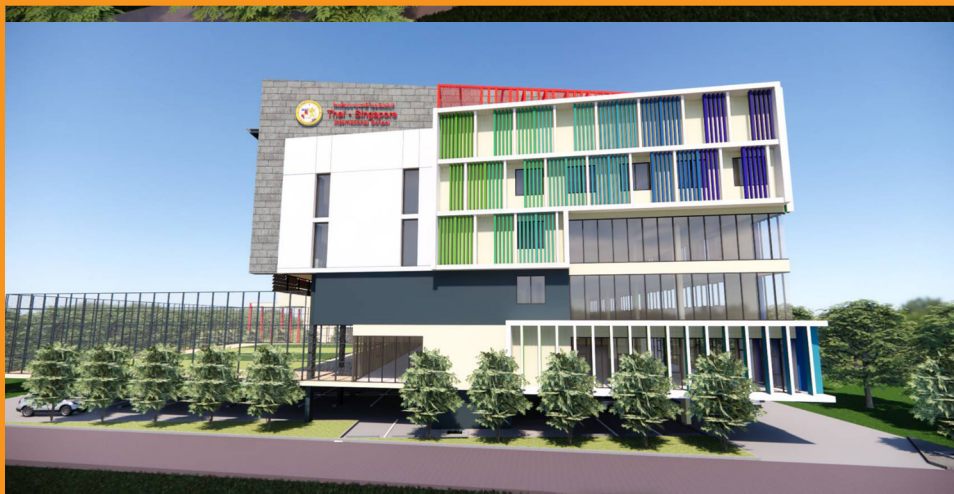
Apologies for the inconvenience as our new campus addition rises, set to be operational by 2025!